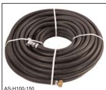
H/B Air Hose