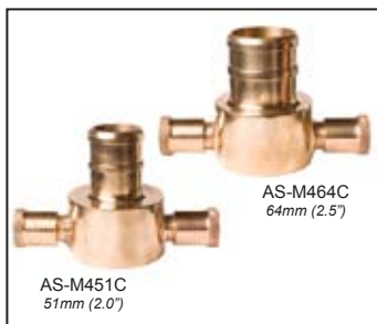
Fire Hose Couplers